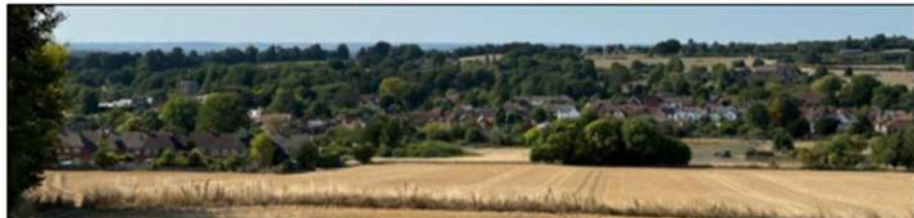
VILLAGE UNDER THE PLAIN: Parish expected to accommodate more than 70 new homes

• It is still possible to nominate sites for designation as Green Spaces or Local Heritage Assets in the new plan by visiting https://www.marketlavingtonnp2.org.uk/ .