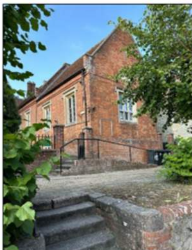
READ REPORT: Online or at library

Villagers now have the chance to give their views on the possible housing sites, and these will be taken into consideration when the neighbourhood plan steering group decides which sites to include in the draft neighbourhood plan. Wiltshire Council expects Market Lavington to provide land for over 70 new homes – but this may increase when the new Wiltshire Local Plan is finalised.