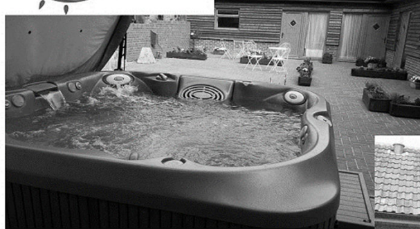
More information & book online www.homesteadstables.co.uk

Tel. 01380 333369 email : <u>homesteadholidaylets@gmail.com</u>