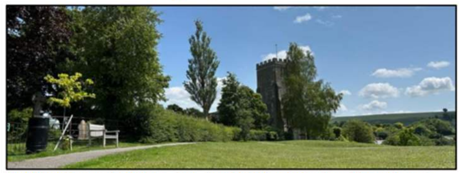
The Village Green: One of five sites already designated as Local Green Spaces

Villagers are being urged to suggest green spaces and local heritage assets they would like protected.