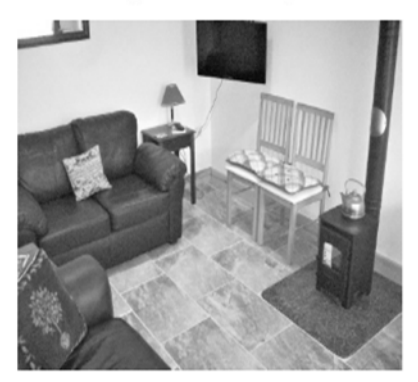
More information & book online www.homesteadstables.co.uk