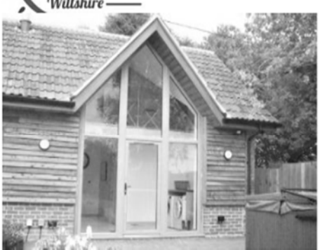
More information & book online www.homesteadstables.co.uk

...is a conversion of stables into four award winning comfortable self catering holiday cottages in Market Lavington.