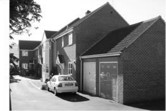
^ George Mews < HCOne Nursing Home