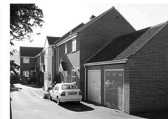
^ George Mews < HCOne Nursing Home