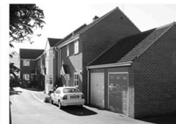
^ George Mews < HCOne Nursing Home