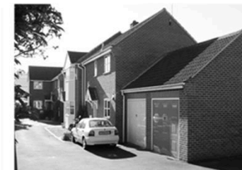
^ George Mews < HCOne Nursing Home